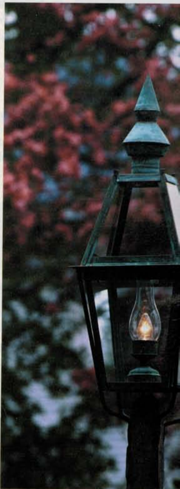
The Ashley House post lantern, model L378, Period Lighting Fixtures, a firm that specializes in antique and gas lighting.

Manufacturer & custom fabricator of 18th- & early-19th-century lighting; original designs from museums & historical societies; Deerfield, Old Sturbridge Village, Williamsburg.