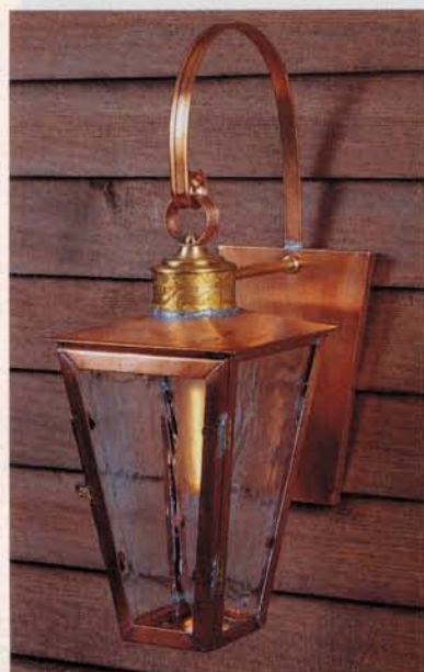
This copper lantern was manufactured by Authentic Designs.

Victorian, Turn of the Century & Mediterranean styles; restoration.