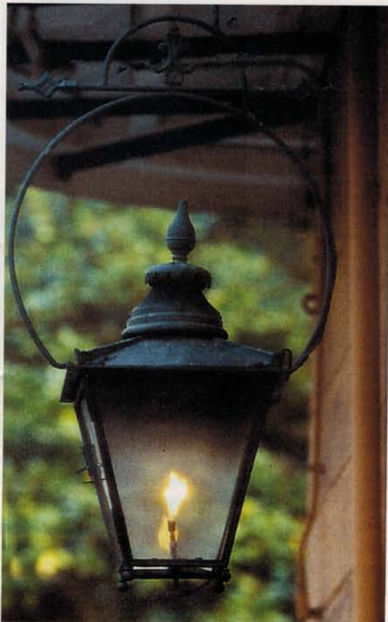
This gas-burning, hand-riveted lighting fixture was produced by Bevolo Gas & Electric Lights.