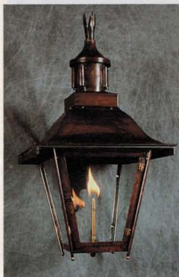
Bevolo manufactures traditional lighting, such as this Napoleon House gas light, in copper and brass.

& standards, address plaques, sign vanes & cupolas; cast aluminum, Victorian & other styles.