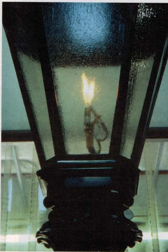
Historical Arts & Casting custom fabricated this cast-metal gas-burning lantern.