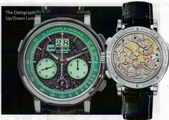
The Datograph Up/Down Lumen

1. With the release of Red: Architecture in Monochrome (Phaidon), the color's meaning is restored. Every single page spotlights a different ruby-hued structure from around the world. We recommend wearing polarized sunglasses while reading. 2. The Nature of Home: Creating Timeless Houses (Rizzoli) is a crowd-pleaser for fans of the nature-obsessed architect Jeffrey Dungan and the photography of ED all-star William Abranowicz. Dungan takes the reader into eight gorgeous homes he designed across the United States, which, of course, leaves us wanting a ninth. 3. If ever there were a monograph to own, it's Shigeru Ban Architects (Images). The Japanese architect won the 2014 Pritzker Prize for his innovative and altruistic work in areas of the world ravaged by cataclysmic events, making buildings out of recyclable materials, such as his iconic cardboard church in New Zealand. Ban's oeuvre is a great reminder of the important effect architecture has on us all.