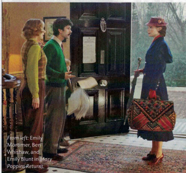
From left: Emily Mortimer, Ben Whishaw, and Emily Blunt in Mary Poppins Returns .